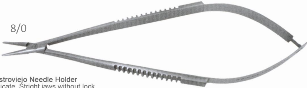
Castroviejo Needle Holder Delicate, Stright jaws,without lock gentle spring action B# 8148 scale : 1