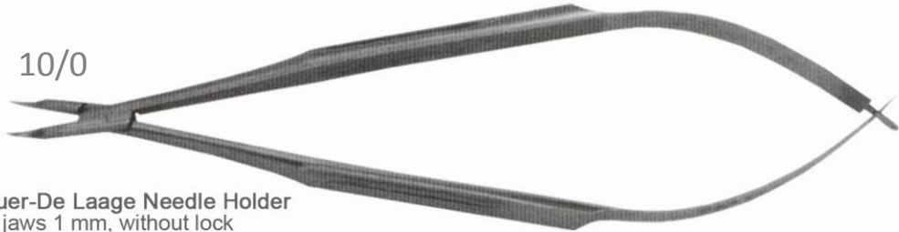
Barraquer-De Laage Needle Holder Curved jaws 1 mm, without lock 13 cm long B# 7251 scale : 1